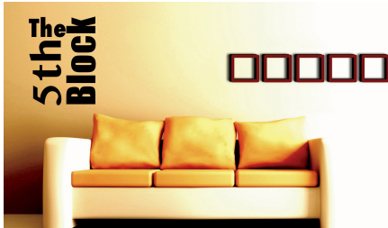
Wednesday's 3:30-5:00 @ the Hub