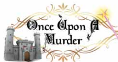
A Timeless Tale of Treachery and Treason in a Kingdom Far, Far Away

Adults: $18 / Children $8 Catering by Sonny's BBQ Tickets on sale through Oct. 11