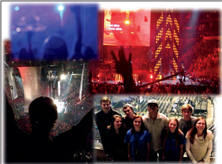
Passion Conference - 2014 ~ Atlanta, GA

We have several fundraisers throughout the school year. We will be holding a Spring Bazaar March 22, 2014. Anyone interested in participating as a vendor can contact the preschool office at 601-992-2244. You can also contact us through our email; preschool@saintmarksum.org . We will be having a Chicken Dinner Fundraiser February 20, 2014 in the CLC from 5:30-6:30 pm. You will be able to dine in or carryout. Tickets can be obtained through the Preschool Office or the Church Office. Please come and support St. Mark's Preschool!