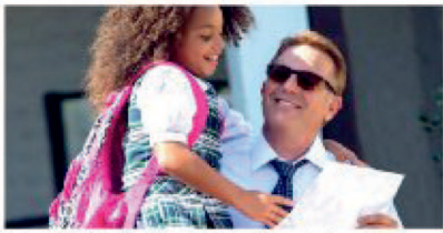
Kevin Costner Octavia Spencer

black or white There's more to family than what you see.