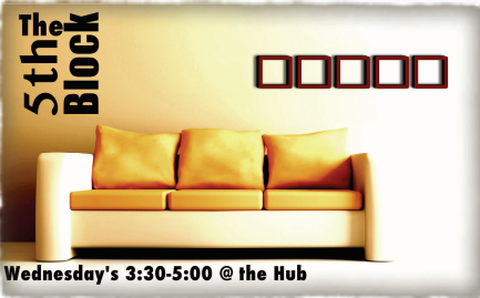
Wednesday's 3:30-5:00 @ the Hub

EVERYONE INVITED! Special activity for children!