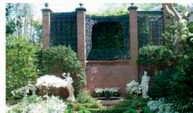
The Biedenharn Museum and Gardens is a home museum and botanical garden located beside the Ouachita River at 2006 Riverside Drive in Monroe in Ouachita Parish, Louisiana, USA.

Leave at 7:00 a.m. Return at 9:00 p.m. Cost is $70.00 Cost includes museum fees, donations, lunch, transportation. Dinner will be on your own.