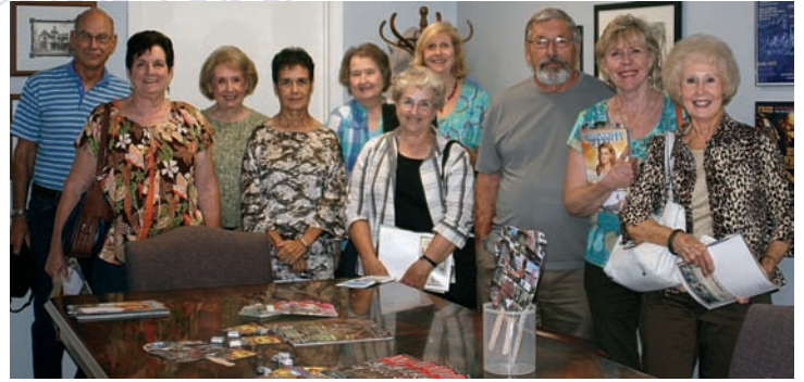
Trendsetters enjoyed a trip to Aberdeen.

On October 23 the Trendsetters will be entertained by the Son Valley Hand Bells. Son Valley is a living center for people with physical or intellectual disabilities. They are located in Canton, but they house residents in apartments and homes in Northeast Jackson, South Jackson, Byram and Ridgeland.