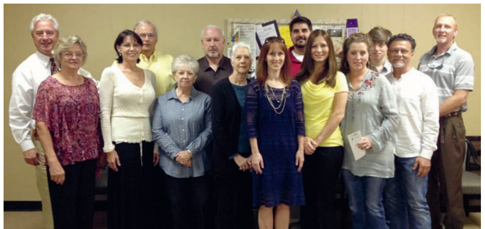
The present Newcomers Class ~ Building more than just buildings

My office is just off the robe room in the main church building. I am available Mon., Wed., and Fri. mornings and some evening hours. You can reach me by phone (601-259-1749) or email ( jhebertlpc@comcast.net ).